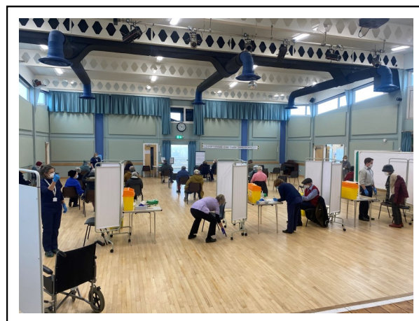
Volunteers at the Sherborne Covid-19 Vaccination Clinic